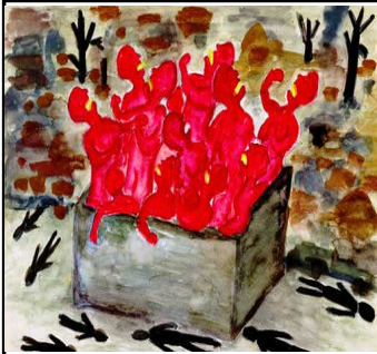
Survivors depiction from memory, of people using water to soothe their burning bodies, only to suffer more.

Although thousands of men, women and children were instantly incinerated in the nuclear infernos of Hiroshima and Nagasaki in August 1945, and although thousands more died in unspeakable agony in the days weeks and months following, there are still alive, today, some of the survivors who were children in 1945. These courageous souls have struggled to stay alive in order to deliver their message to the world, “Never again must any human being suffer this hell.” Psychically and physically, it is beyond what human beings can bear.