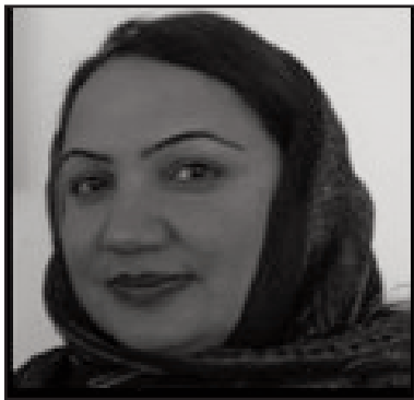
Shukria Barakzai, MP from Kabul