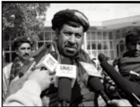
Gul Agha Shirzai: warlord, accused drug lord, ex-presidential candidate & US crony

6. After the US announces it will leave, replace US/NATO control of security operations and training with a temporary and neutral peacekeeping collaboration acceptable to the Afghan government, with a Muslim country in a lead role. Their mission: to protect the people, enable development projects to proceed, train the army Afghans want and the honest community police they still don't have.